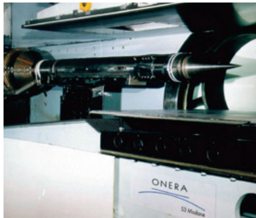
(3) ONERA, Mach 1.7~3.0